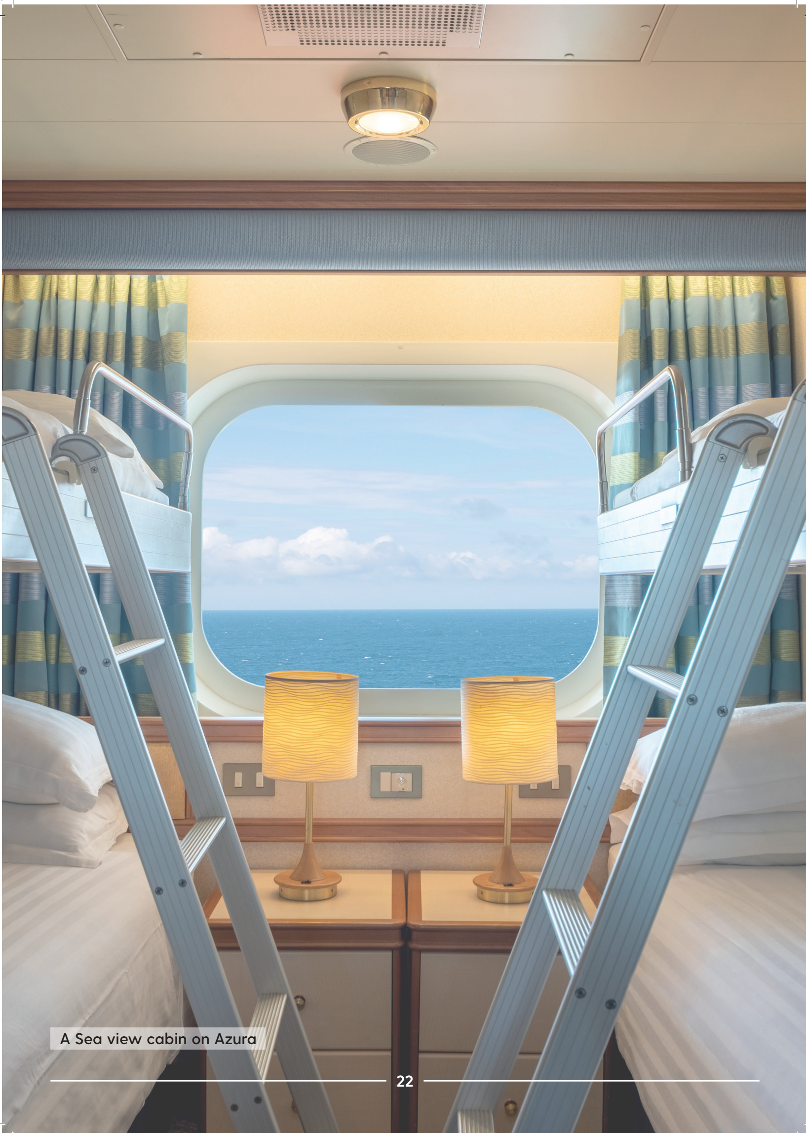
A Sea view cabin on Azura