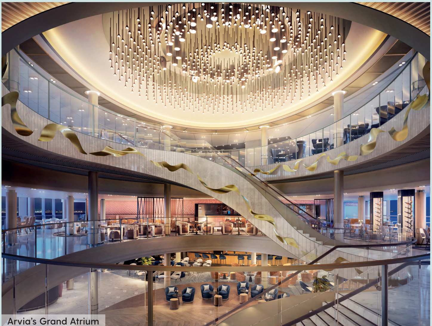
Arvia's Grand Atrium

There'll be lots of people walking around and exploring the ship. I'll get to explore the ship, too. It's a fun way to see everything and get to know where we will be staying for our holiday.