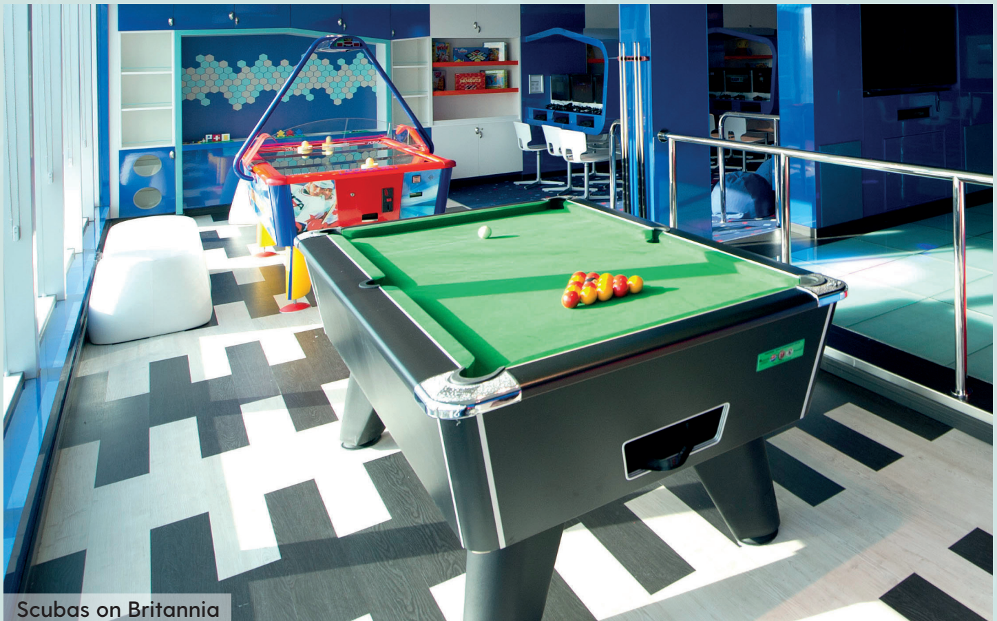
Scubas on Britannia